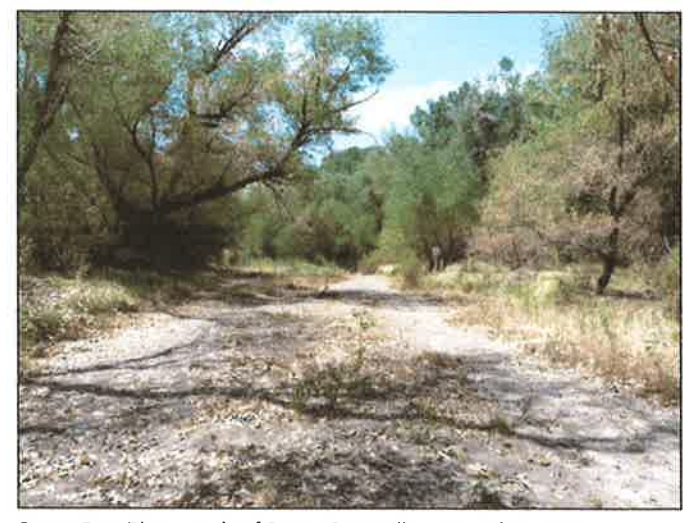
Santa Cruz River north of Santa Gertrudis Lane, July 3, 2013.