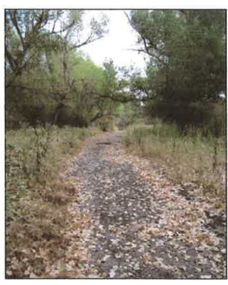
Figure 1. Cottonwood leaf drop at Tumacácori NHP along the dry bed of the Santa Cruz River, July 1, 2013.

The Santa Cruz River is an effluent-driven system, with most of its surface water provided by the NIWTP, in Arizona. In 1951, the plant discharged around 1.6 million gallons/day (mgd). Over the decades, that amount increased steadily as the international population it serves expanded. The