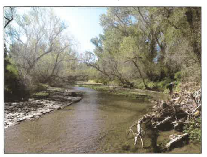
Santa Cruz River upstream of Santa Gertrudis Lane in 2012, flowing at approximately 12 cubic feet per second.